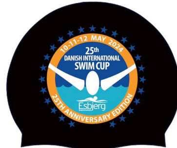
13. Swim Cup swim cap