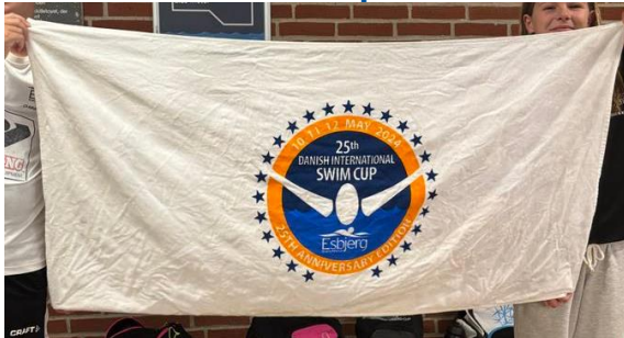
14. Swim Cup towel