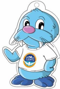
12. Swim Cup mascot keyhanger