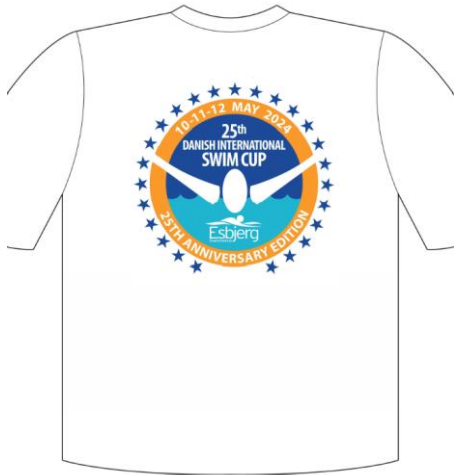
10. Swim Cup t-shirt