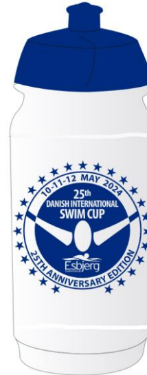
11. Swim Cup drinking bottle