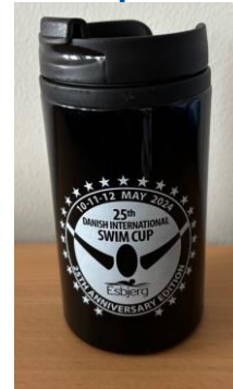
15. Swim Cup thermal cup